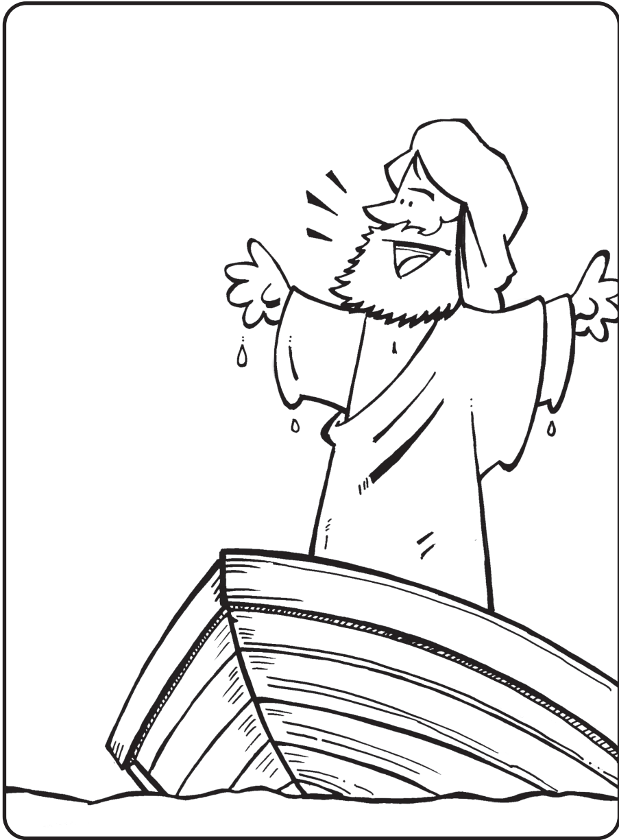
Jesus stood up in the boat and lifted his arms. "Peace. Be still."

Circle the things that are still. Draw a line under the things that move.